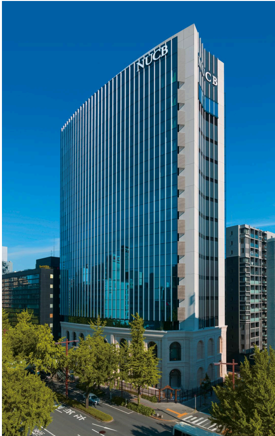
NUCB Business School